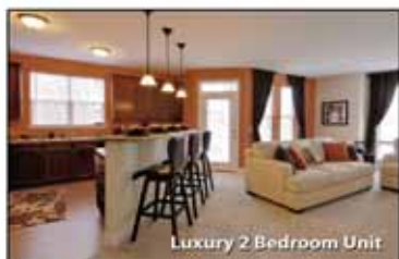
Luxury 2 Bedroom Unit