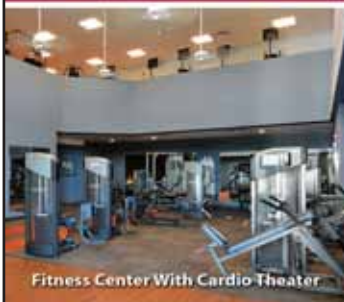
Fitness Center With Cardio Theater

LIVE • SHOP • DINE • EXERCISE • UNWIND • ENTERTAIN