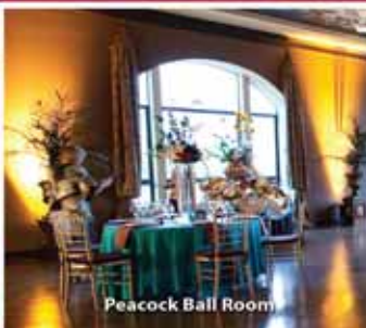
Peacock Ball Room