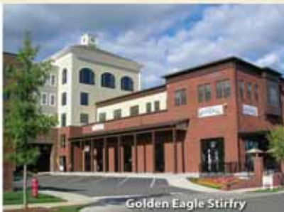
Golden Eagle Stirfry